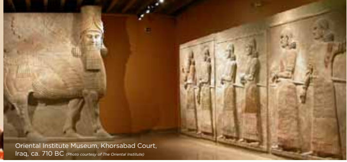
Oriental Institute Museum, Khorsabad Court, Iraq, ca. 710 BC